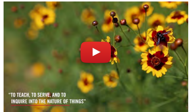
▶ The UGA Golf Course's sustainability video