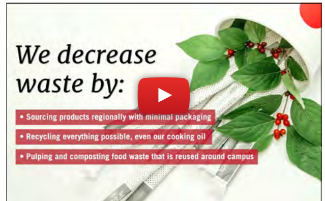
▶ Dining Services' sustainability video

Commit to Staying Safe, Bulldogs! Stay diligent with hand washing, social distancing and masking up to help slow the spread of COVID-19.