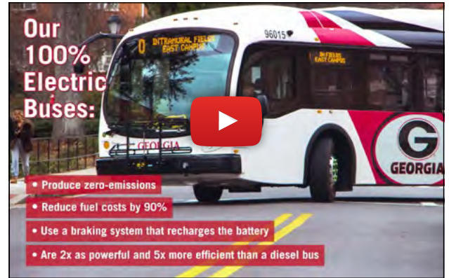
▶ Transportation and Parking Services' sustainability video

Across Auxiliary Services, we continue to see our departments seeking out sustainable solutions to their everyday problems. For more information on Auxiliary Services sustainability initiatives, visit auxiliary.uga.edu .