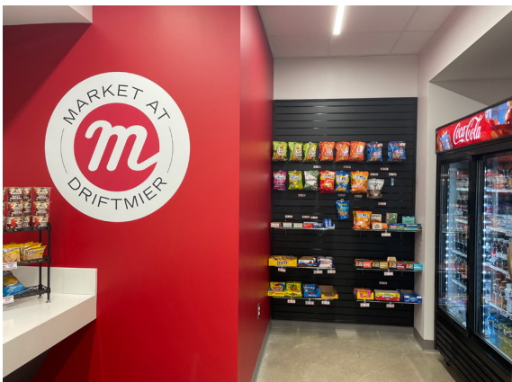
The Market at Driftmier is a self-serve location that is accessible anytime the building is open.

For a full list of locations, visit dining.uga.edu/locations .