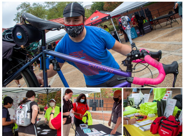
(top) Bike Athens and the Office of Sustainability offered free bike inspections at Bike & Pedestrian Safety Day; (bottom) On- and off-campus partners spoke to students about safe practices and gave away items such as personal emergency kits, a bike pump, and a Fitbit.