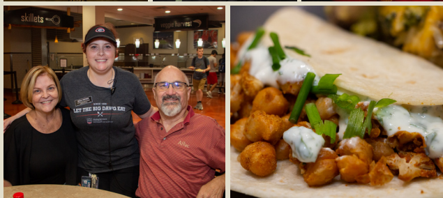
The From Our Home To Yours event took place on Thursday, September 30 in the dining commons. Menu items ranged from layered lasagna, jaeger schnitzel, and broccoli beef stir fry to chicken and dressing and cauliflower chickpea tacos.