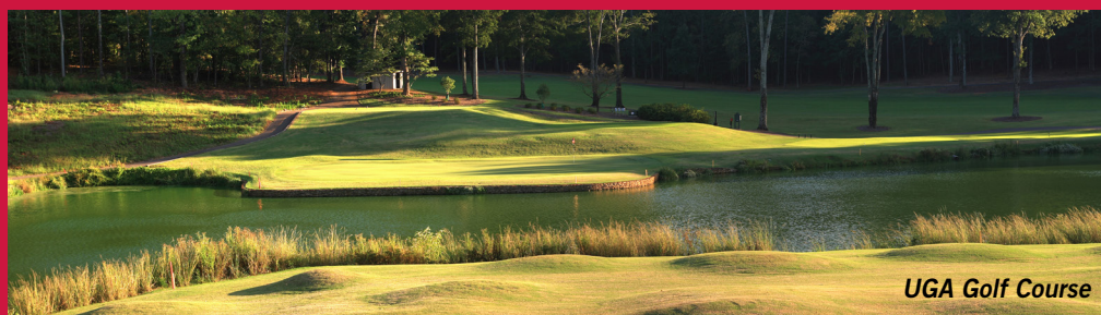
UGA Golf Course